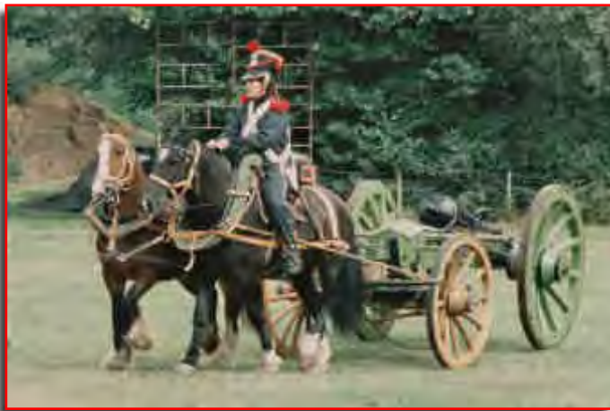
French Imperial Guard horse-drawn artillery at Military Odyssey, Kent, over the August Bank Holiday 2006.