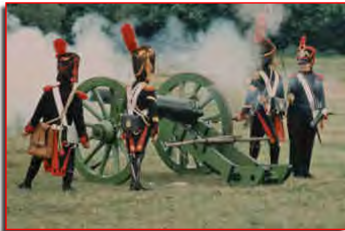
Guard artillery in action at Military Odyssey. Details of the event can be found at www.military-odyssey.com